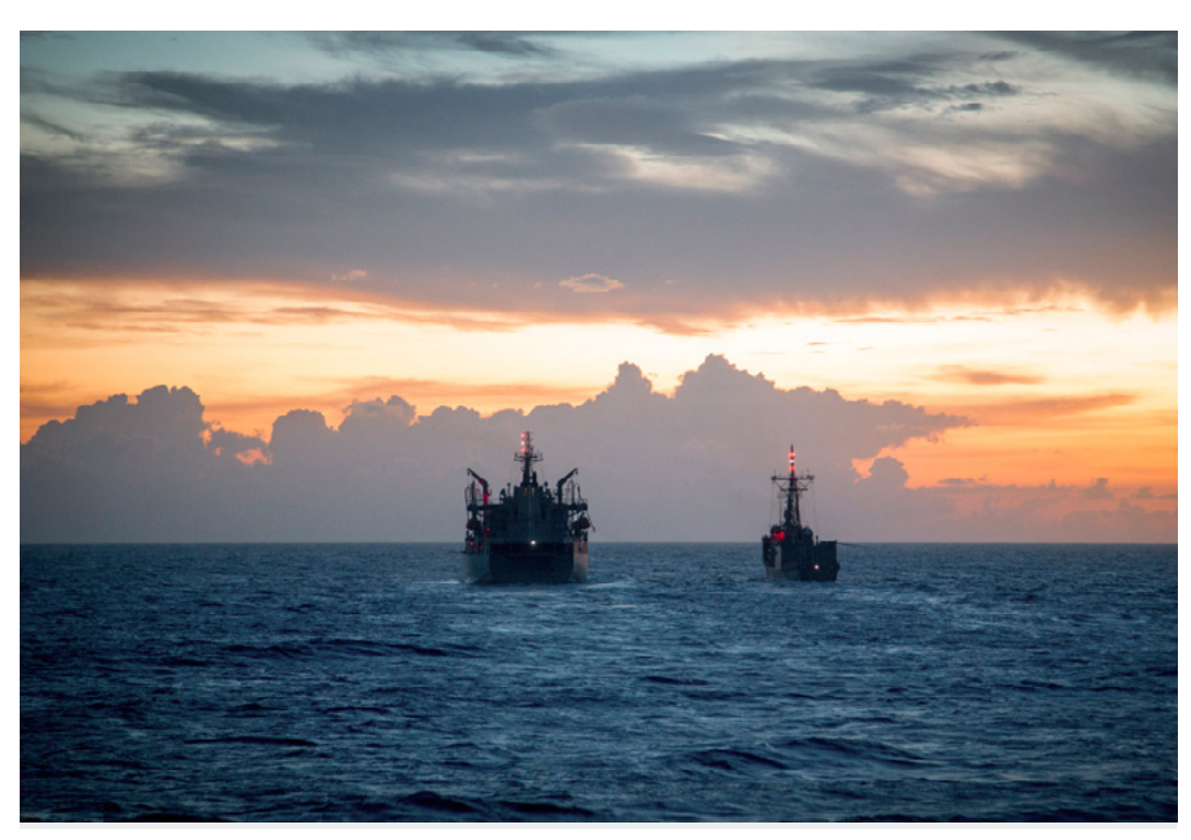
HMAS Melbourne prepares to conduct a night time replenishment at sea with HMAS Sirius while transiting in the South China Sea

"We are open to conducting multilateral activities in the South China Sea to demonstrate that they are international waters"