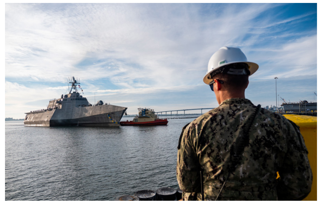
The future littoral combat ship USS Tulsa arrives in San Diego after completing its maiden voyage from the Austal USA shipyard.