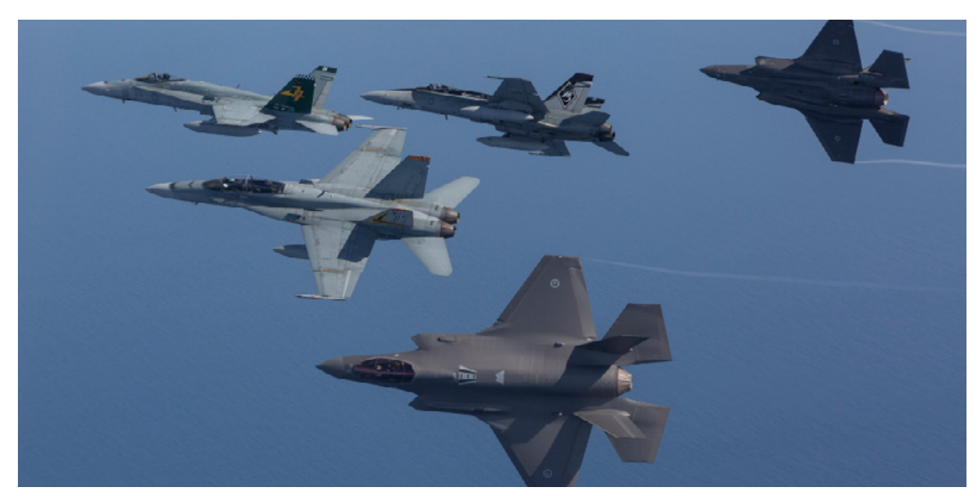
F-35A Joint Strike Fighters fly in formation with an F/A18 Hornets