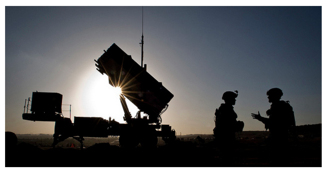
US soldiers talk after a routine inspection of a Patriot missile battery.