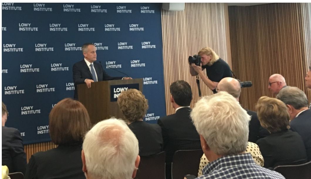
Opposition Leader Bill Shorten has said that little will change for Defence under Labor.

Other foreign policy priorities for a Labor government include improving Australia's relationships with Indonesia and India, appointing a global human rights ambassador, improving the aid budget as an investment in regional and national