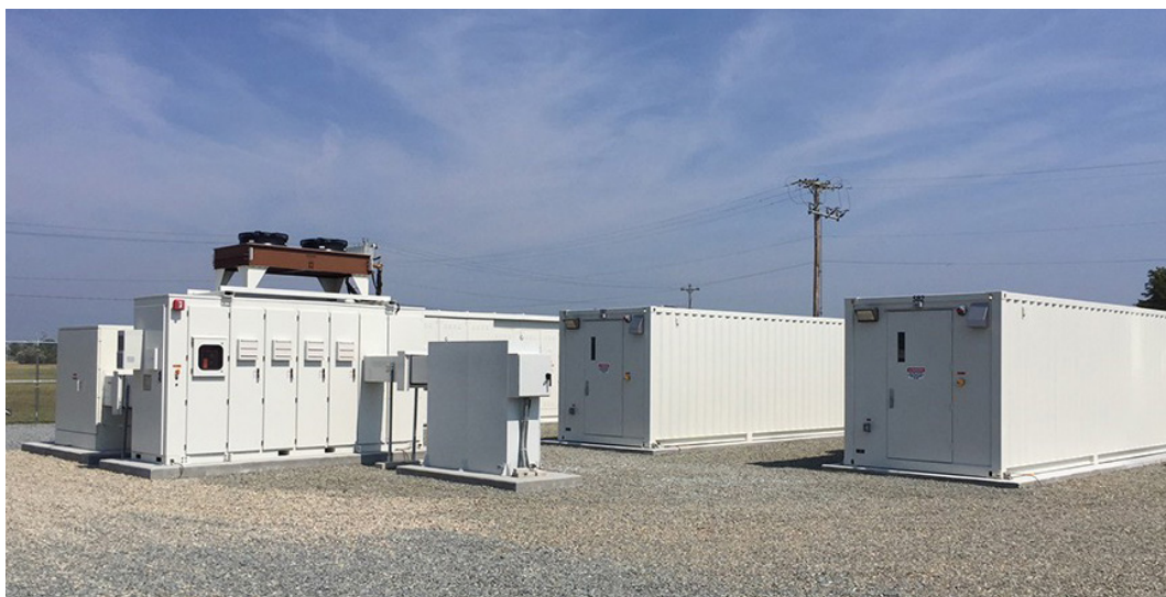
The base will rely on the microgrid to provide reliable and secure power to critical infrastructure.

“Our team has had the invaluable opportunity to work with its Australian technology, alongside the Otis base personnel, Raytheon, and organisations like MIT Lincoln labs and the US National Renewable Laboratory.”