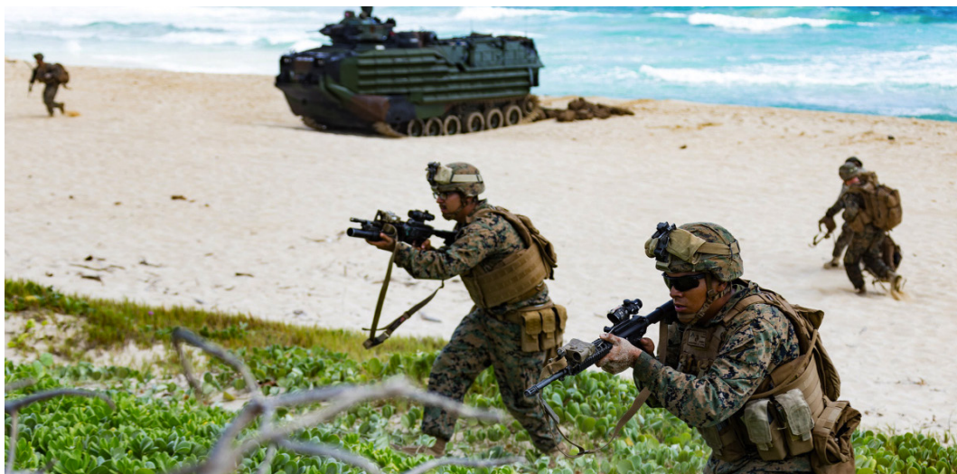
Ballistic plates with Australian technology could be used to protect US Marines.

Initial evaluations produced positive results earlier this year, and additional test helmets will be sent to the US government for further testing.