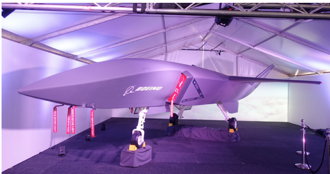
A full-scale model of Boeing's X-47B unmanned aircraft on show at Avalon.