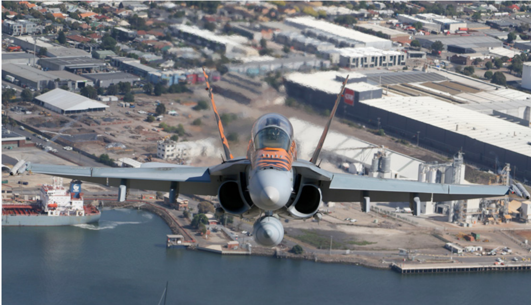
Avalon 2019 is the largest airshow in the southern hemisphere.