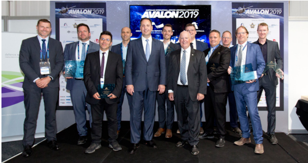
The host of winners from the Innovation Awards include technologies ranging from aerial camera systems to non-destructive testing. AVALON 2019