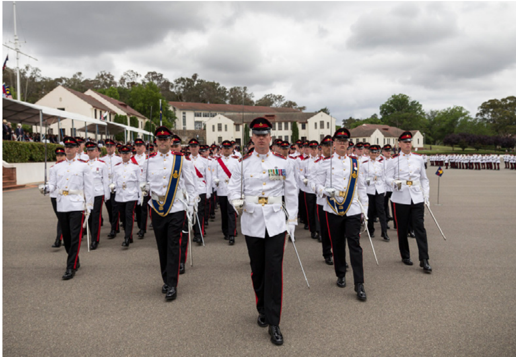
The December 2018 graduating class of the Royal Military College Duntroon march off the parade ground.