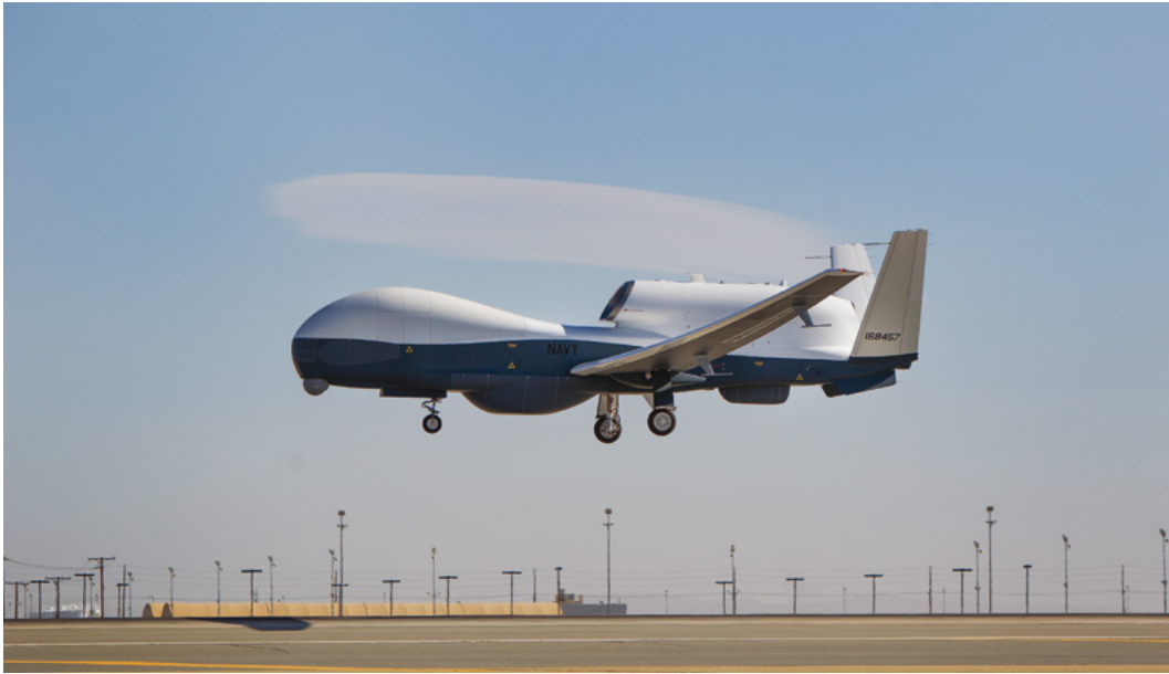
The expanded coverage towards Antarctica means that Triton will represent a unique whole-of-government capability. ALEX EVERS