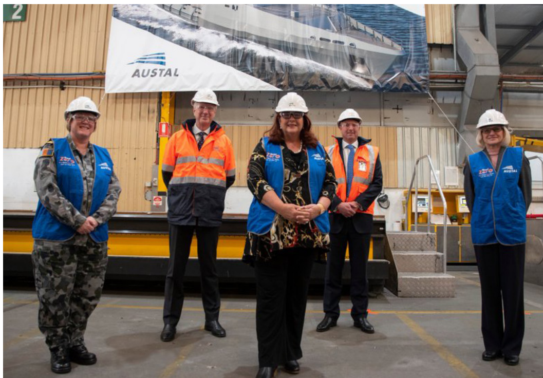
Minister for Defence Industry Melissa Price at the Austal yards in WA.

"The six new Cape Class Patrol Boats will be built with a number of enhancements, improving operational capability and crew capacity compared to the vessels already operated by both the Navy and the Australian Border Force," Minister for