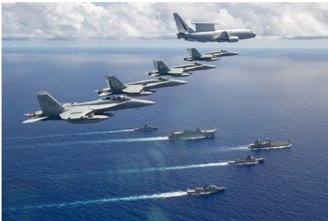
A RAAF E-7A Wedgetail from No. 2 Squadron, three F/A-18A Hornets from No. 77 Squadron and an EA-18G Growler from No. 6 Squadron.

elements, to generate an overall air and sea picture.