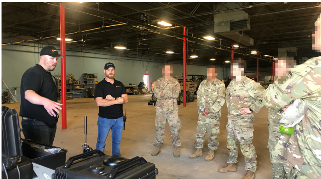
Company representatives running a demo for the USAF.