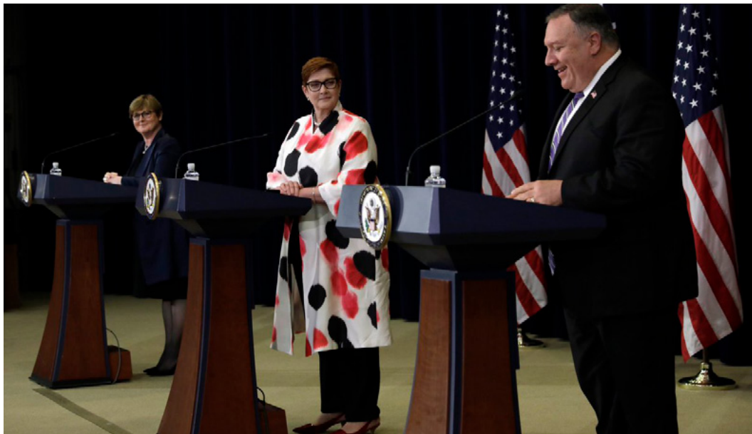
Minister for Defence Linda Reynolds, Minister for Foreign Affairs Marise Payne and US Secretary of State Mike Pompeo.