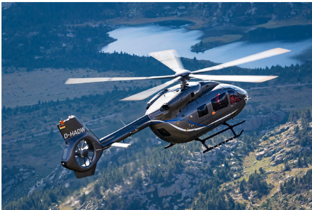
WA Police will be the first Australian customer to operate the five bladed H145.