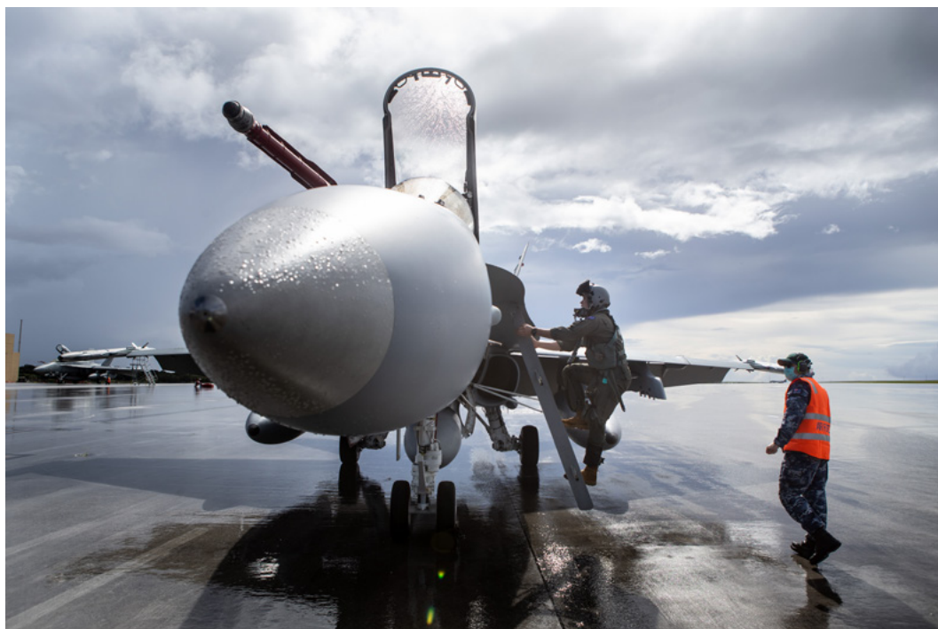
A pilot from No. 77 Squadron boards an F/A-18A Hornet A21-36 aircraft prior to an air-sea integration mission at Andersen Air Force Base.

The transit to RIMPAC provides Navy an opportunity to practice joint warfare. Training will include an E-7A Wedgetail aircraft working alongside the maritime