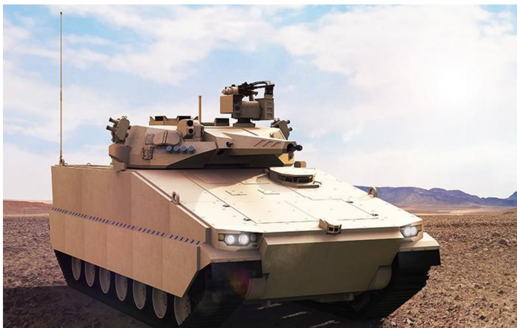
The Redback IFV is based on Hanwha's indigenous K21 IFV.

"TWO REDBACK RMA VEHICLES HAVE BEEN SHIPPED FROM PYEONGTAEK PORT AND WILL ARRIVE IN MELBOURNE IN LATE AUGUST"