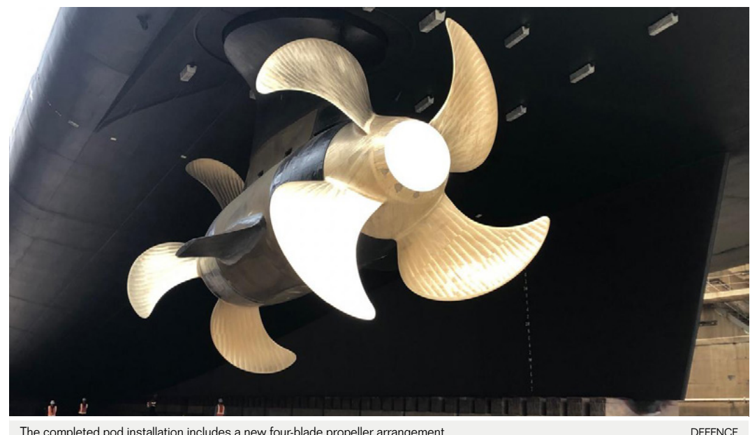
The completed pod installation includes a new four-blade propeller arrangement.