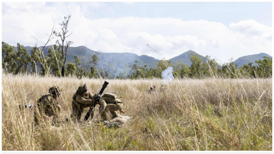
Soldiers fire an 81mm Mortar during Exercise Diamond Catalyst at Shoalwater Bay Training Area

NIOA and Day & Zimmermann have signed a new three-year Memorandum of Understanding, which includes a four-year supply program of 81mm HE and practice mortar ammunition for the ADF as well as the opportunity to provide other Day & Zimmermann munitions products suitable for export to Australia.