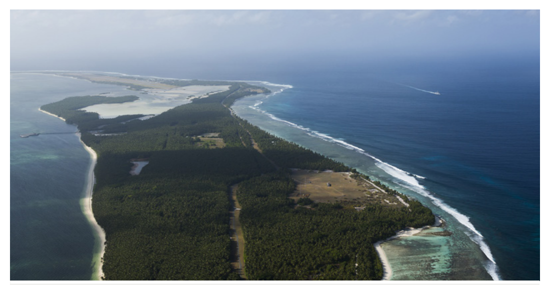
RAAF's fleet of P-8A Poseidons and M-55A Peregrine aircraft will forward operate from the Cocos (Keeling) Islands.