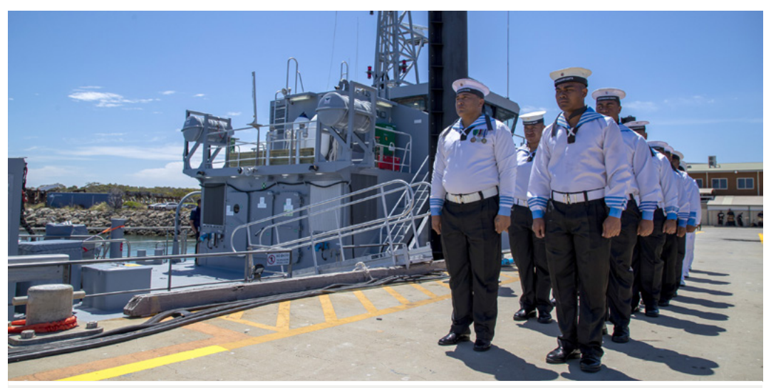
The crew of a Tongan Guardian-class patrol boat prepare to march onboard after the ship was officially handed over.