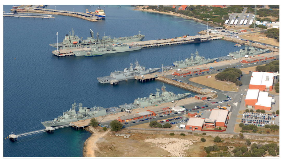
The project will provide the first stage of essential, land-based facilities and infrastructure requirements at Fleet Base West. DEFENCE