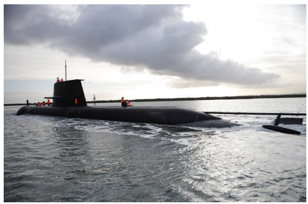
Jeumont Electric also has experience on the Collins class submarines

transferring the capabilities to support the operation and sustainment of the subsystem to Jeumont Electric Australia. Jeumont Electric Australia will be the Engineering Design Authority providing training, conducting various levels of maintenance tasks and managing spare parts for the Main Electric Propulsion Equipment.