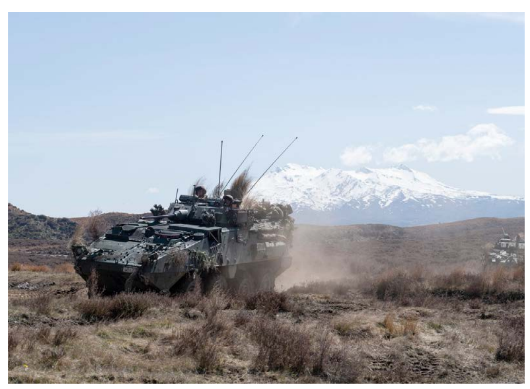
NZ's 1 Brigade on exercise in the Wajouru Training Area