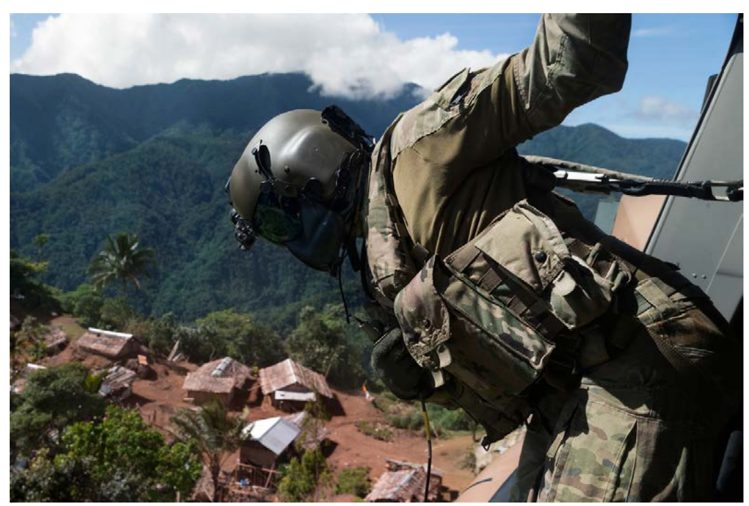
An Australian MRH-90 lands to deliver polling boxes in the Solomon Islands.

As part of the Tulagi lease, China's Sam Group will be able to survey the island for oil and gas developments, contravening many Pacific island nations' demands for global climate action to protect their pristine environment and quality of life.