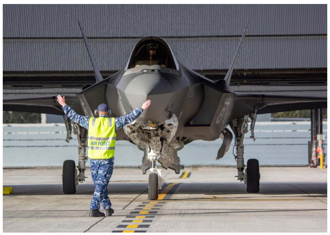
The arrival of F-35s at RAAF Williamtown is an opportunity for Hunter defence industry

"Defence can be a hard sector to crack if you don't have the required accreditations, contacts and quality standards, but the rewards are rich for those who make