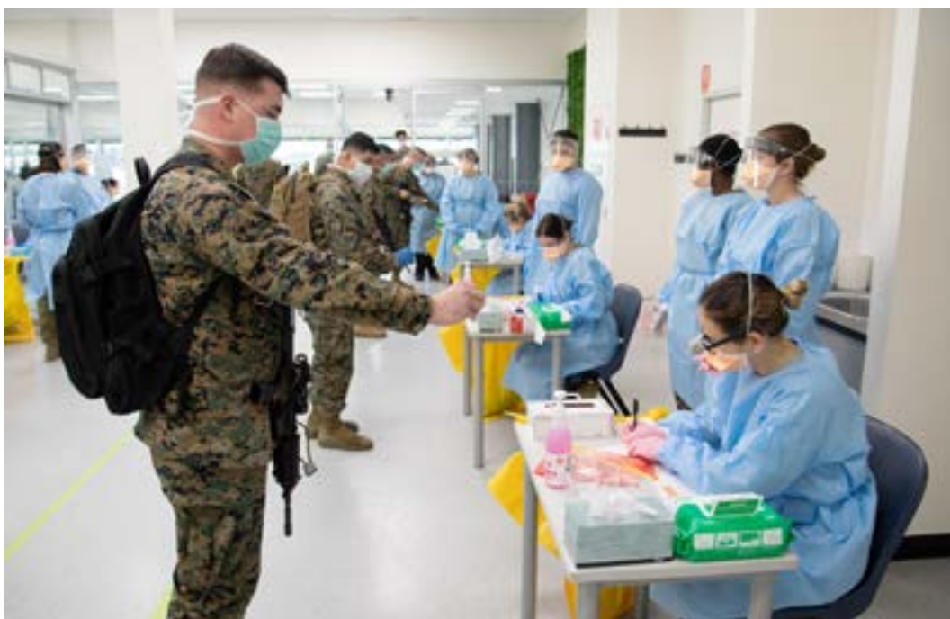
Last year's rotation also arrived under the shadow of Covid-19.

These opportunities are a priority for the US Force Posture Initiatives, developing people-to-people links, interoperability and the sharing of expertise."