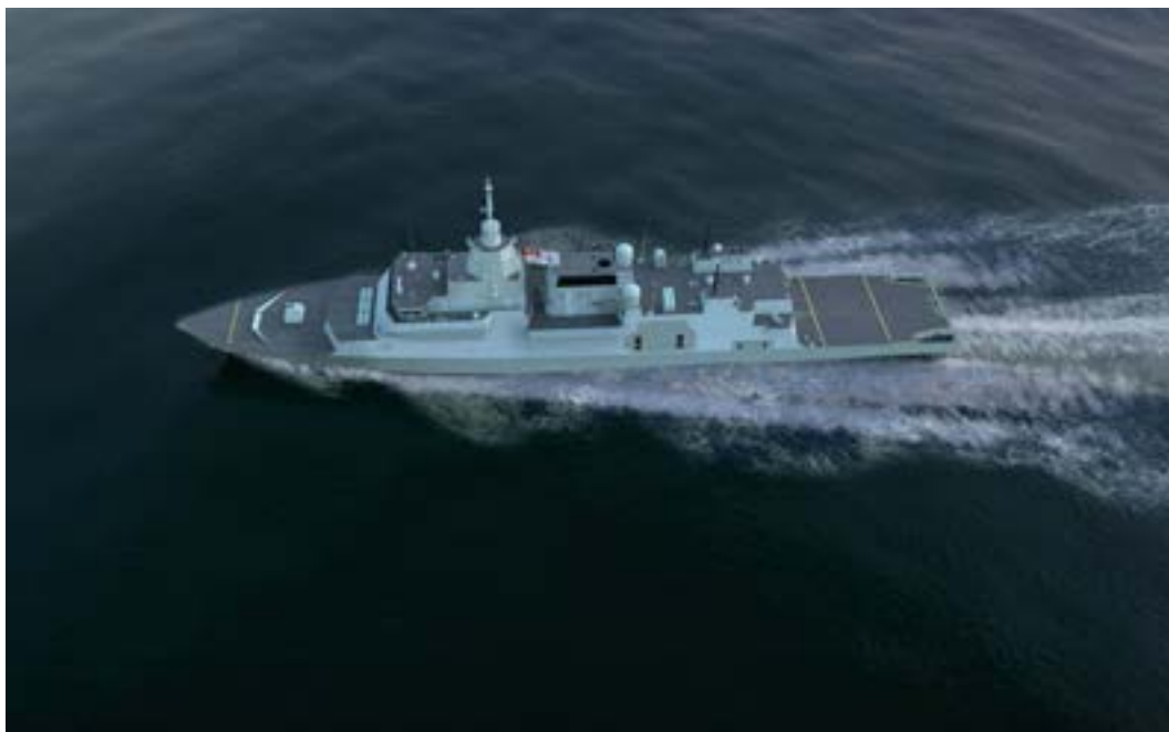
The Canadian Surface Combatant, like Australia's Hunter class, is based on the Type 26.