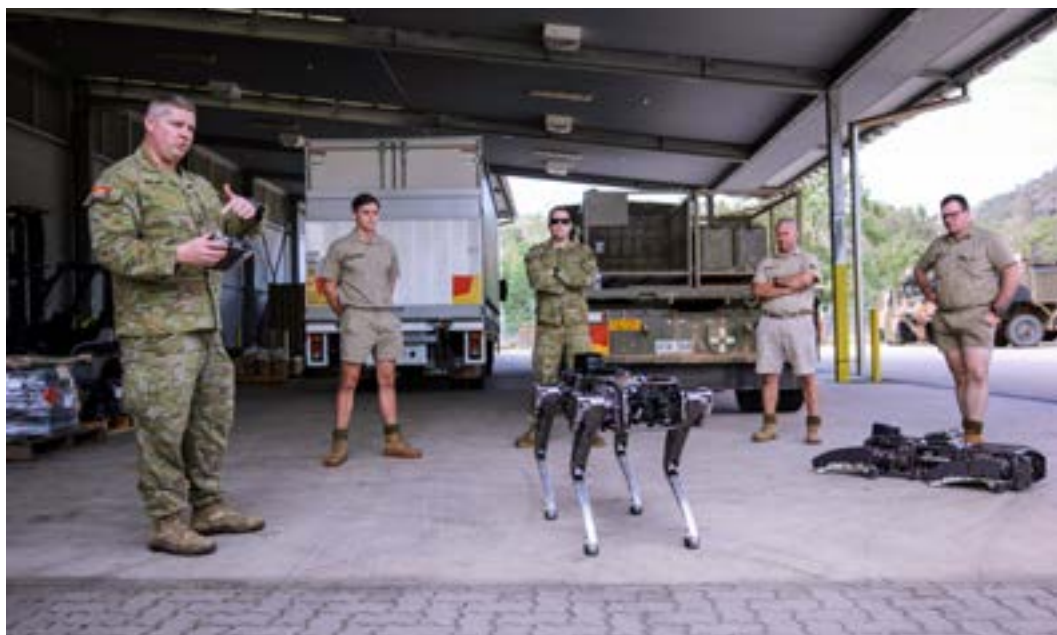
Soldiers are instructed on how to use the Ghost Robotics Quadruped Robot during a demonstration at Lavarack Barracks.