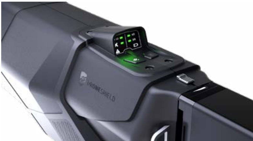
DroneShield is looking to gain a foothold in India.