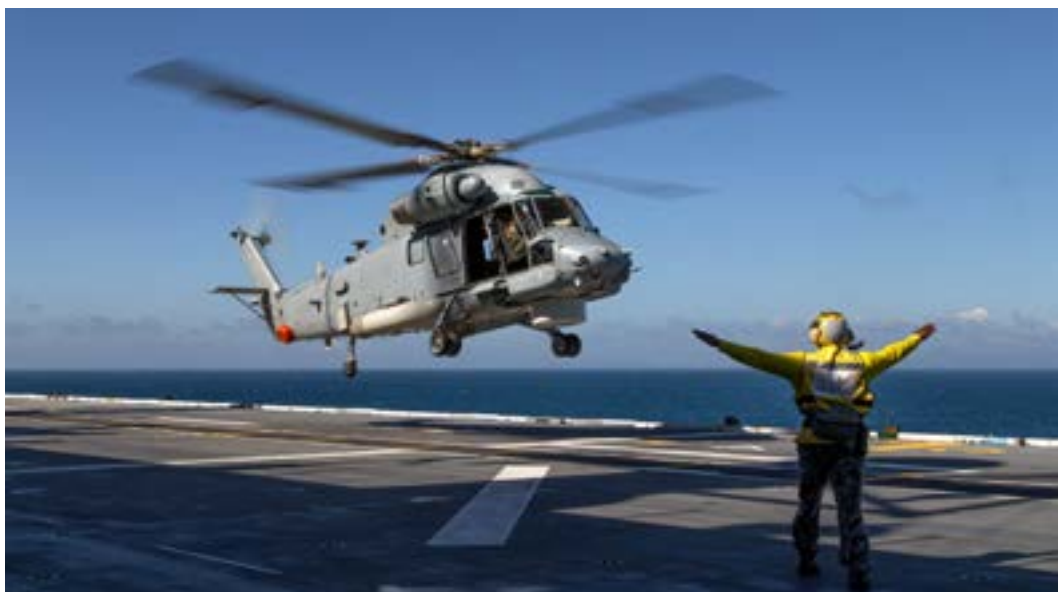
This aircraft was the last Spitfire acquired by the RAAF and was built by Supermarine in England in 1944.

"The heritage fleet of 100 Squadron will