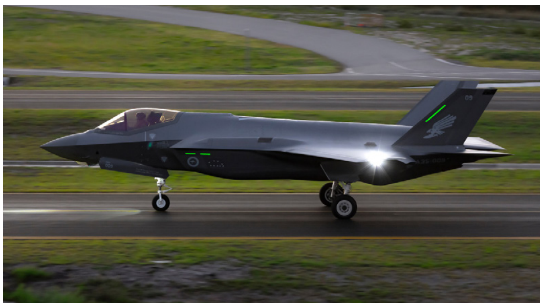
The change will benefit the manufacture of hydraulic components for the F-35 program.

Industry 4.0 refers to the advancement of interconnectivity between devices, equipment, tools, visualisation systems, and the human users within the manufacturing