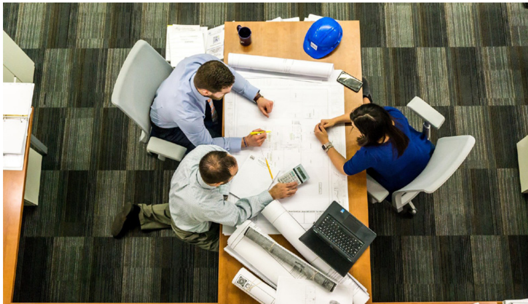
The change will affect SMEs during a time of great uncertainty.