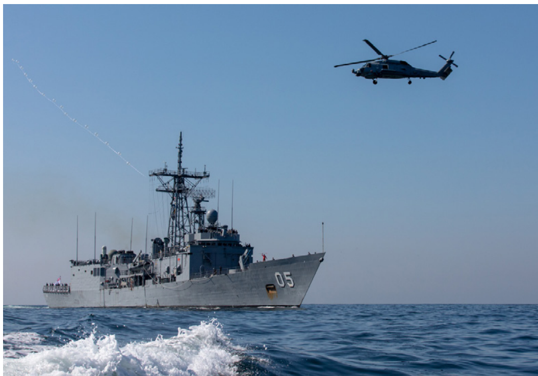
HMAS Melbourne sails into Sydney Harbour for the last time.

Greece is seeking new warships for acute operational requirements related to protecting gas fields around Cyprus from Turkish incursions.