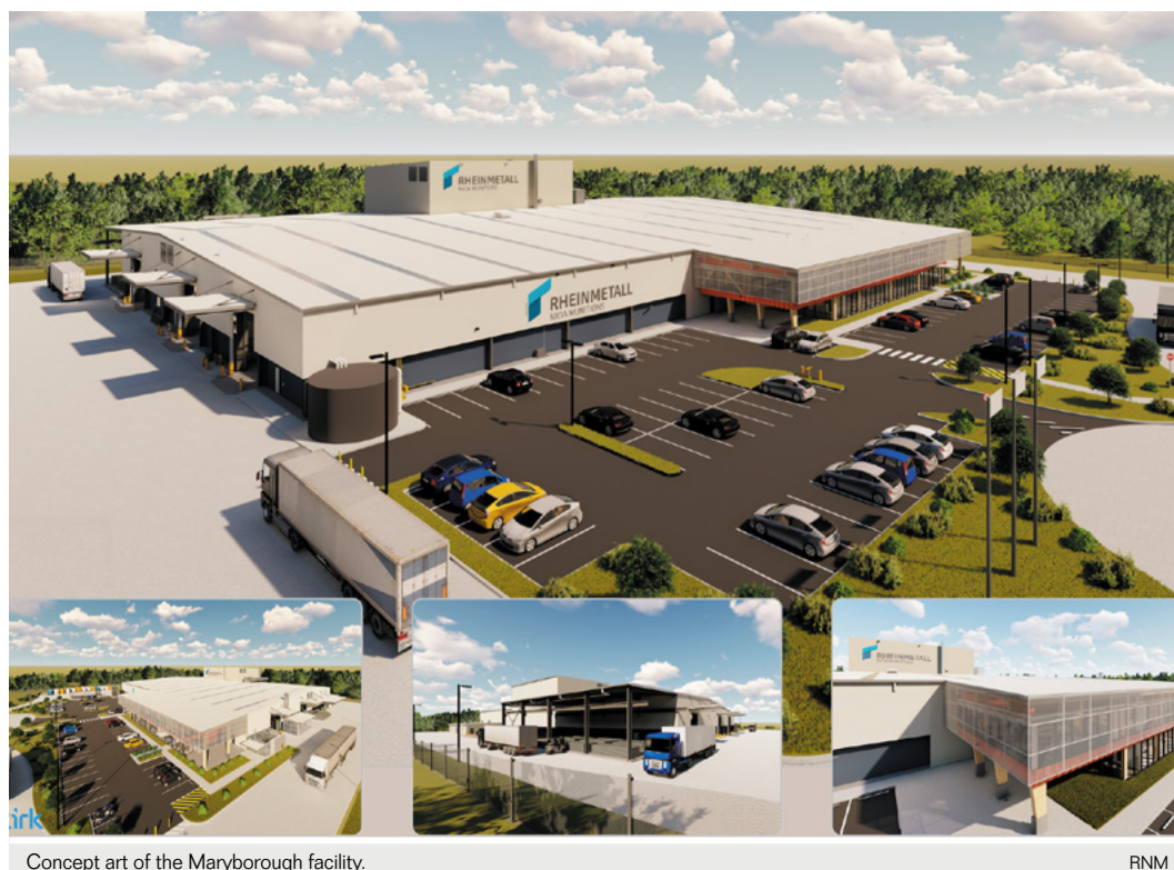
Concept art of the Maryborough facility.

Recruitment at RNM has already begun for senior managers and engineers with employment in advanced manufacturing roles to open late 2020, early 2021.