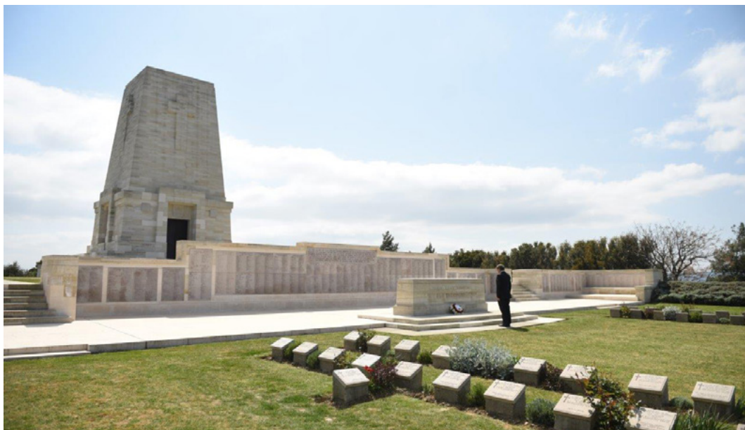
Burak Gundogan laid wreaths alone at Lone Pine cemetery, accompanied only by a photographer.

H is effort comes as commemorative Anzac Day events around the world are among the gatherings to have been cancelled to help slow the spread of coronavirus. Australians and New Zealanders instead marked the occasion at the entrance to their properties.